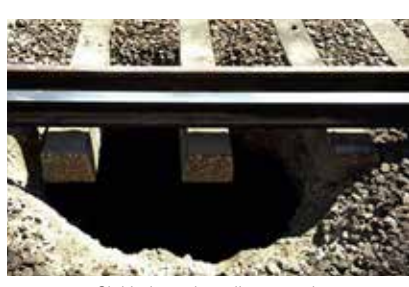
Sinkhole under railway tracks

Easily accessible by cloud Secure Data Storage.