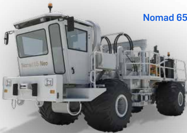
Nomad 65 Neo