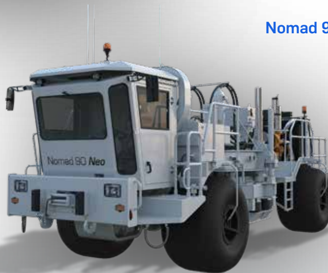
Nomad 90 Neo